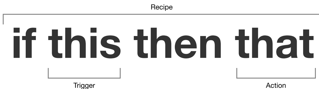
Figure 2 – Example of a rules-based programming system

40 Some of the above could be achieved using a simple rules-based programming system, such as IFTTT ( Figure 2 ).